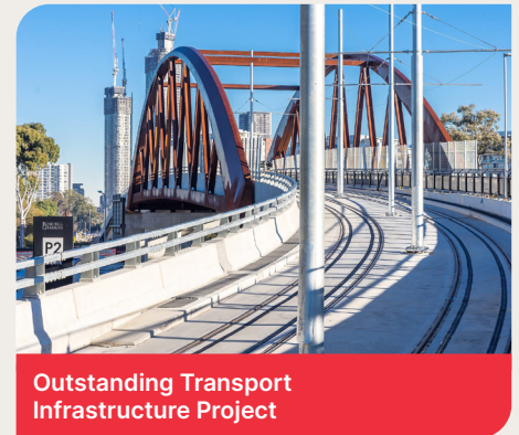
Outstanding Transport Infrastructure Project

This special precinct is keeping the best and brightest talent in Western Sydney who can work and live in the region and enjoy their passion for motorsport.