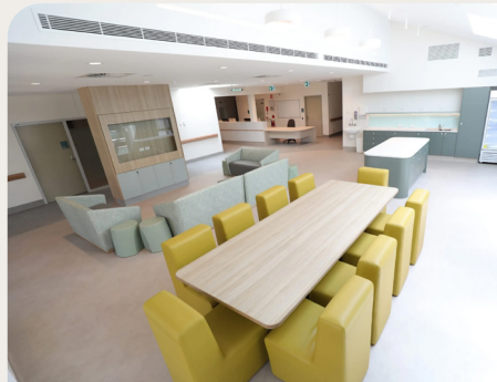
Outstanding Health Project

Western Sydney University's Bankstown City Campus is a transformative and pivotal cornerstone propelling the progression of Bankstown CBD and Greater Western Sydney. The impressive 18-storey tower comprises of nine levels for education and nine levels for industry. It exemplifies innovative and sustainable development, combining world-class architecture, design and the highest achievable sustainability credentials. The campus will contribute to a range of long-term social and economic benefits for the region.