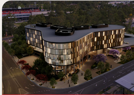
Outstanding Tourism & Hospitality Project

Designed by Andrew Burges Architects, McGregor Coxall and Grimshaw, the new Parramatta Aquatic Centre replaces the demolished Parramatta Memorial Pool and provides a recreational, civic and community hub for the City focussed around and celebrating the pleasures of swimming in a parkland setting. Thanks to a major joint investment from the NSW Restart Fund and City of Parramatta Council, the project provides learn-to-swim and children's play areas, indoor and outdoor pools, large-scale wellness and recreation centre and multi-purpose community and function rooms.