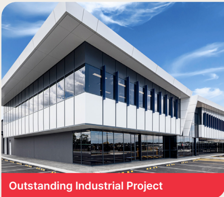
Outstanding Industrial Project