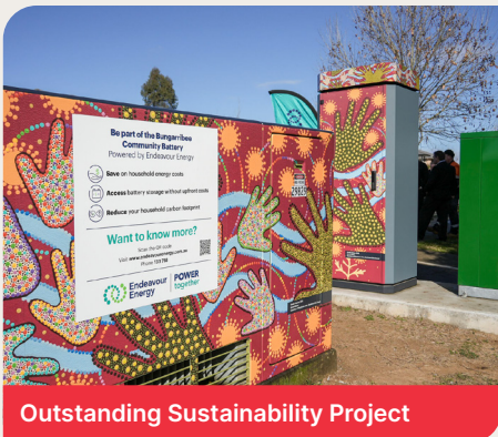
Outstanding Sustainability Project

Bidgee Bidgee Bridge is the largest new bridge delivered on Stage 1 of the Parramatta Light Rail project in Rosehill, and spans across James Ruse Drive. Bidgee Bidgee Bridge has become the state's second longest steel arch bridge span, weighing 1425 tonnes, and measuring 64 metres long and 16 metres high. The bronze-coloured steel arch structure was installed during meticulous overnight engineering, which involved the use of four self-propelled modular transporters.