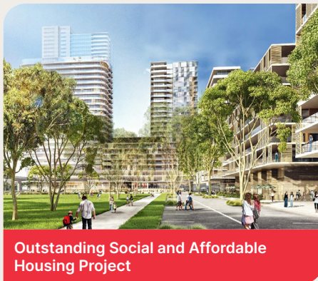
Outstanding Social and Affordable Housing Project

Western Sydney has switched on its first community battery in Blacktown. Endeavour Energy's goal is to decarbonise the grid by 2035 and create a two-way energy network that delivers resilient, efficient and reliable electricity for everyone living in the West. Now fully subscribed, the Bungarribee community battery works by enabling local residents to generate, store and share solar power without having to buy a battery.