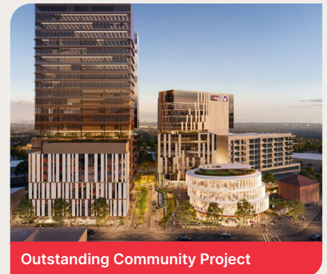
Outstanding Community Project

The Lidcombe Rise project is an innovative collaboration between community housing provider Evolve Housing, Housing Australia, NSW Land and Housing Corporation and developer Billbergia Group, who all strive to ease housing pressures across Australia. The successful development of Lidcombe Rise will see a total of 376 new homes with 63 social housing units, 93 affordable housing units and 220 private dwellings across four buildings in a growing neighbourhood.