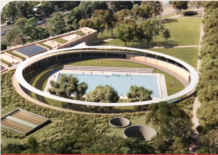
Outstanding Sport & Recreational Project