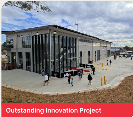
Outstanding Innovation Project

Designed by SBA Architect, the 24/7 global logistics hub is a key part of the 300-hectare Aeria precinct, which also includes Bankstown Airport, supporting more than 6500 jobs and contributing over $1 billion to the NSW economy each year.