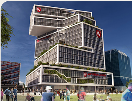
Outstanding Education Project

Imagine shifting almost 27 million cubic metres of earth to build a brand-new airport to take Western Sydney to the world. Delivered by an Acciona CPB joint venture, one of Australia's largest earth moving projects began in September 2018 and took five years and up to 311 earth moving machines to complete. In an incredible win for circularity and sustainability, nearly six million tonnes of high-quality sandstone was then brought in from tunnelling projects across Sydney to lay the foundations for Sydney's new international gateway.